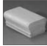
C-6310 Rail 3 1/2" W x 2 3/8" H