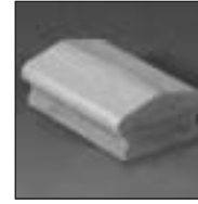
C-6600 Rail 3 1/2" W x 2" H