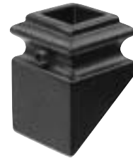
C-2390 3/4" Rake Collar with Set Screw F, M, A, S, C

Structural tests to ICC standards, performed by an independent university testing facility, proving the integrity of our new LITE-IRON™ series are available upon request.