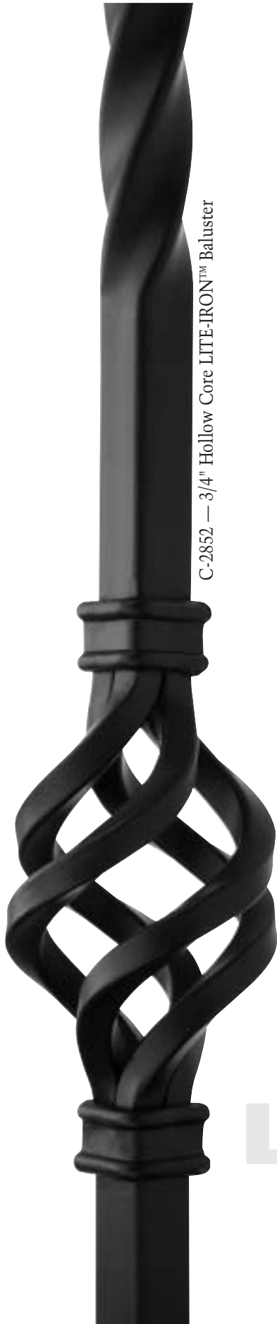
C-2852 — 3/4" Hollow Core LITE-IRON™ Baluster